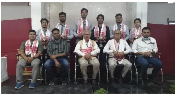
Graduate Pharmacy Aptitude Test (GPAT-2021) qualified candidates with Principal and Faculties, GIPS.

Graduate Pharmacy Aptitude Test (GPAT) is a national level entrance examination for admission in post-graduate pharmacy programme conducted by National Testing Agency (NTA) . GPAT qualified candidates receives scholarship and other forms of financial aids (in the field of pharmacy) from Government of India.