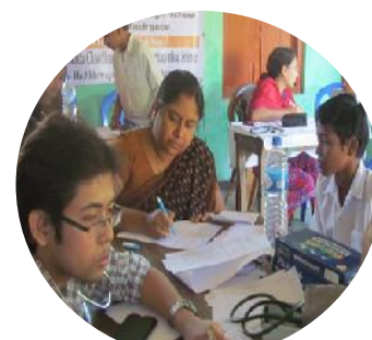
Free health camp