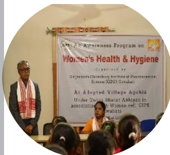
Unnat Bharat Abhiyan